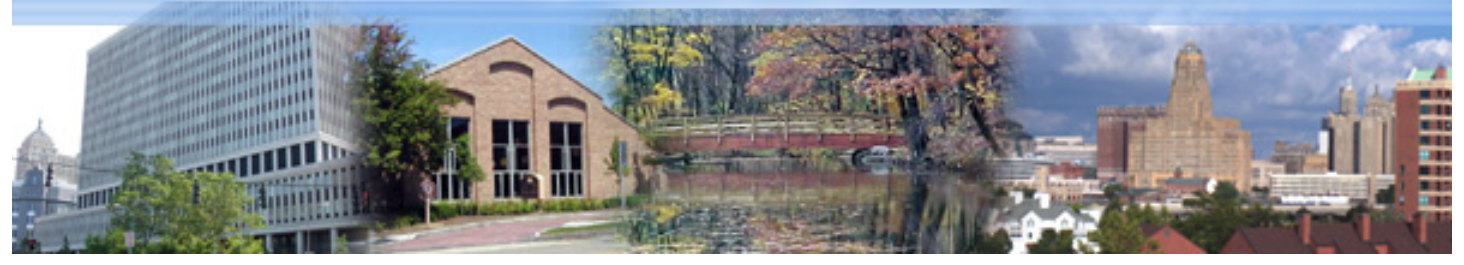
Volume 1, Issue 11